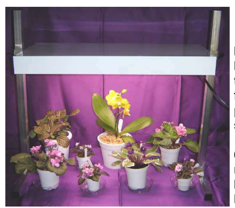
Table Model Grow Lite Stands

A variety of styles and sizes of lighted plant stands are available ranging from small table models to large free standing units. All items are shipped via United Parcel Service directly from the factory to you except the grids for the trays. The grids will come from The Violet Showcase.. Most customers receive their stands within 5 - 8 working days after the order is placed with the factory. The factory will not ship stands via the U. S. Postal Service. The prices shown below are for the product only and do not include shipping. Please contact The Violet Showcase with the adress to which a stand of interest to you will be sent. You will be contacted with a shipping quote.