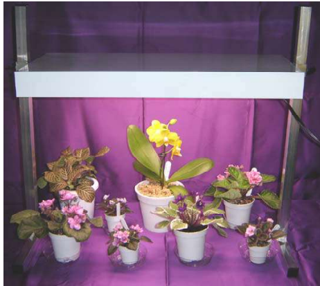
Table Model Grow Lite Stands

A variety of styles and sizes of lighted plant stands are available ranging from small table models to large free standing units. All items are shipped via United Parcel Service directly from the factory to you except the grids for the trays. The grids will come from The Violet Showcase.. Most customers receive their stands within 5 - 8 working days after the order is placed with the factory. The factory will not ship stands via the U. S. Postal Service. The prices shown below are for the product only and do not include shipping. Please contact The Violet Showcase with the address to which a stand of interest to you will be sent. You will be contacted with a shipping quote.